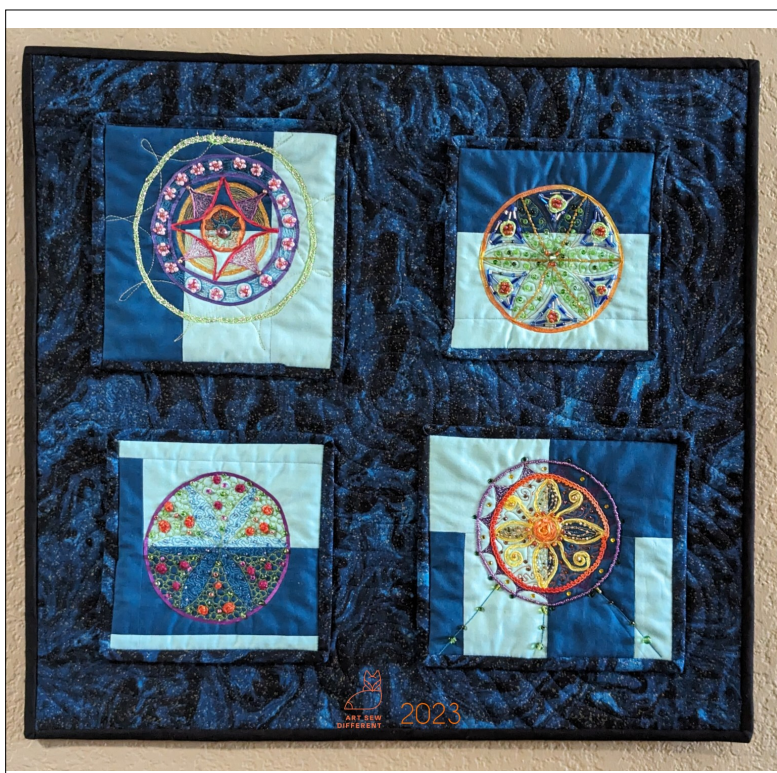
Being & Becoming (2023)

Influenced also in part by Thich Nhat Hanh's quote, "The whole cosmos has come together to create you. You carry the whole cosmos inside you. That is why, to accept yourself and to love yourself is an expression of gratitude," Being & Becoming is an artistic depiction of our gentle and compassionate relationship to ourselves and the greater Universe of which we are a part.